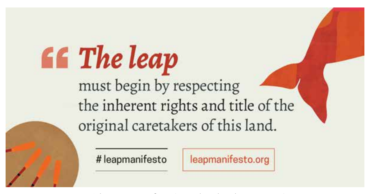
© The Leap Manifesto (reproduced with permission)

crisis - "a crime against humanity's future" - can serve as the spark igniting such a transformation, as there is no other way to deal with the crisis than by redefining basic socio-economic and state structures. In turn, the Manifesto's repeated defence of the inherent rights and title of the Indigenous peoples of Canada shines an unavoidably harsh light on both the resource-extracting capitalist project that Canada is, and the need to 'indigenize' and decolonize Canadian left-wing 'alternatives' traditionally rooted in extractive industrialism.