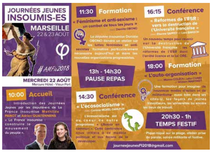
Advertising leaflet with the programme of the Youth Summer School

The leadership encourages mobilisations on local issues - "Know your Rights" caravans tour the poorer parts of some cities; a long-neglected local school was (illegally) repainted by a local network supported by the FI; these examples are relayed by the leadership and the social networks, though have not flourished as quickly as had been hoped. The FI held a summer school and a youth summer school as most French parties do. The youth summer school included lectures by well-known Marxists as well as representatives of the non-Marxist Left. Feminism, eco-socialism, self-