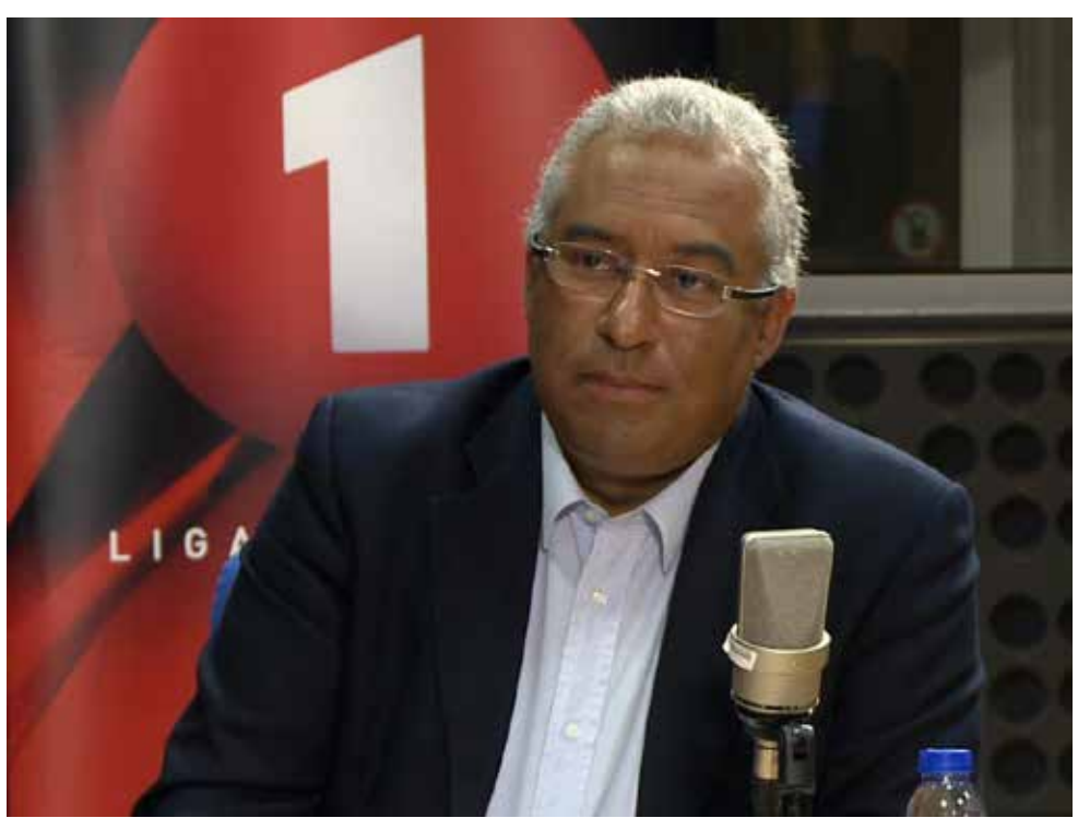
António Costa

The following pages will map this potential 'Fourth Way' to social democracy by first contextualising the emergence of the 'Contraption' and assessing its term in office. Next, it will