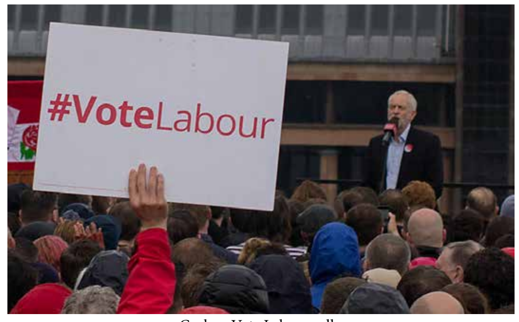
Corbyn Vote Labour rally

This shift mirrors one at the grassroots. At my first local party meeting after rejoining Labour in September 2015, I was one of several 'new' members. We were repeatedly told by longstanding members that they were a successful local party focused on campaigning, aka going door to door to identify Labour voters with the aim of winning elections. There is a tension at the heart of Labour 's current internal struggle between seeing electoral politics as the only relevant locus of action and seeing our goal as being to create a social