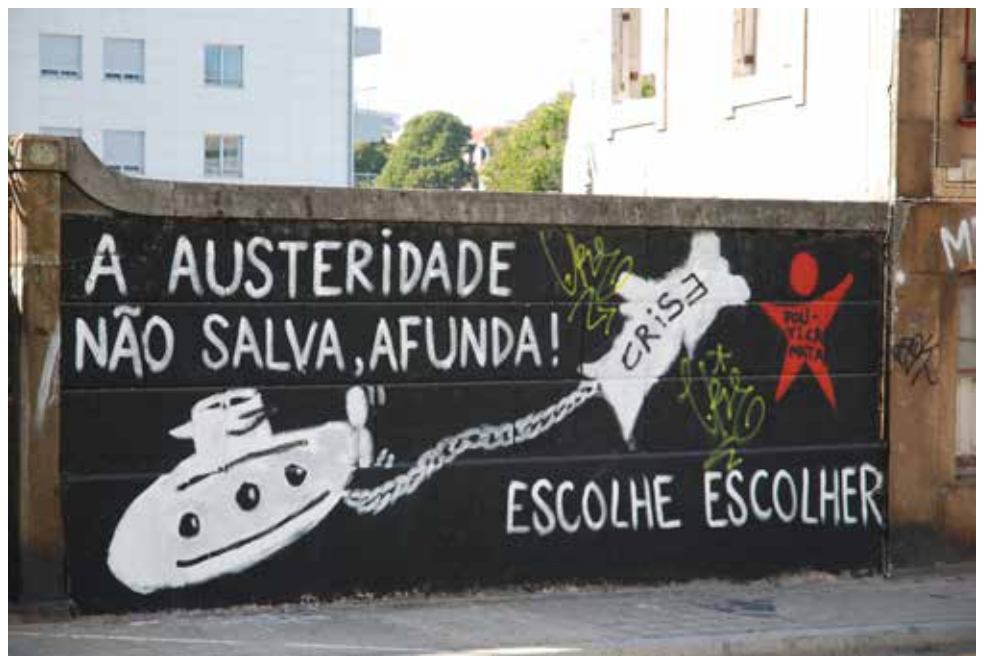
Portuguese anti-austerity graffiti

policies. For that reason, the strongest constraint to social democratic politics is membership of the monetary union. As Moschonas put it, the institutional design of EMU effectively 'limits social democratic freedom of manoeuvre' (2014: 253; see also Sloam and Hertner, 2012: 36) as governments privilege fiscal discipline over social justice.