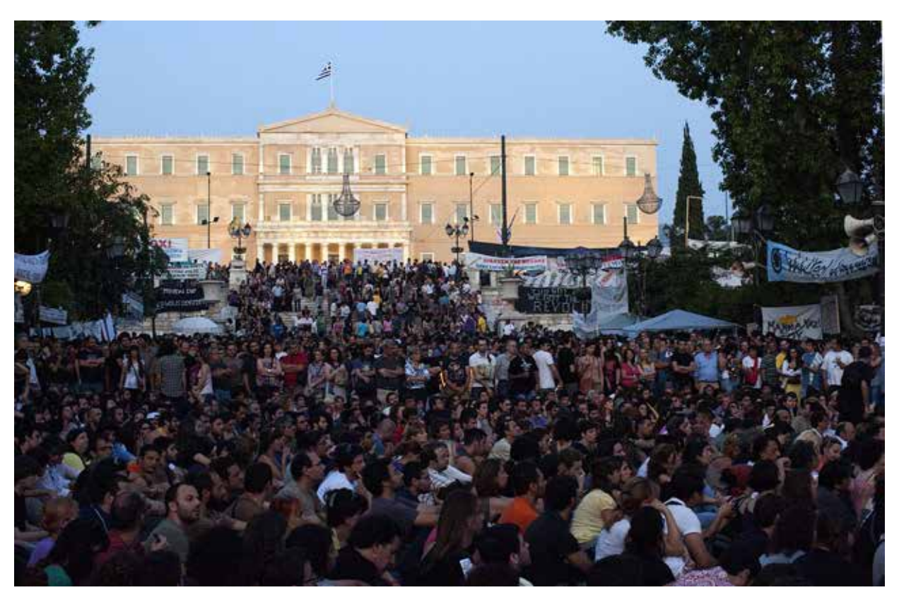
General mass of Indignados in Athens Syntagma, Greece (30 June 2011)

Towever, paradoxically, SYRIZA ■ succeeded in channeling the social energies again towards institutionalism. From 2011 to 2015, SYRIZA rose from a party receiving four per cent of the popular vote to the strongest force in parliament. One explanation for this is the party's strong orientation towards, and links with, the social movements in the 2000s, which for many people testified to its trustworthiness. Another the parliamentary-political route appeared to be the most realistic option to get rid of the austerity programme: most realistic, because the social movements had succeeded in destabilising the party system, but not in radically challenging economic relations. While many cooperative forms