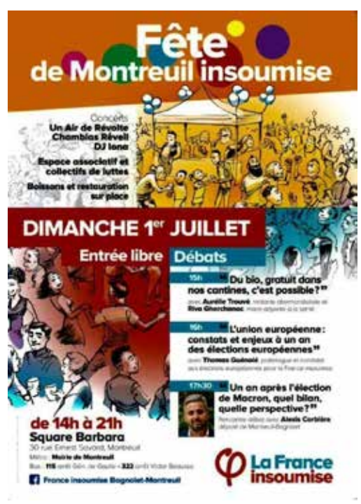
Advertising leaflet for public day of debate and entertainment

the rest of the economy and calls for "a severing of the links" between industry and agriculture on the one hand, and the financial world of speculation on the other. This is an old Communist Party view of the economy and depends on the idea that finance capital is separate from other sorts (whereas often industrial investors have a speculative financial operation on the go at the same time).