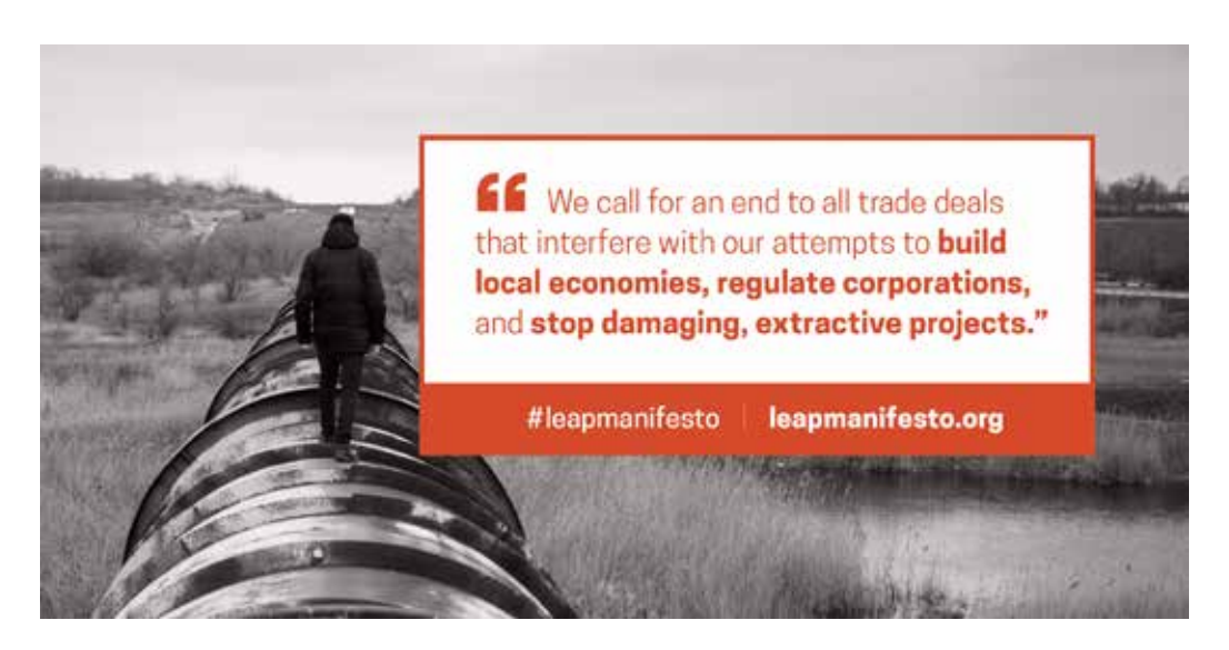
© The Leap Manifesto (reproduced with permission)

Leap Manifesto, arguing instead that the vague document fails to tackle the crucial issue of inequality and instead focuses on resource extraction. Laxer poses a number of questions: How do we build the new green economy? How do we create the new green industries that will be at the heart of the economy? How do we ensure that large corporations no longer set the economic agenda and that the rich pay their share of taxes? Unfairly, in my view, he argues that these questions "are given very short shift in Leap" and derides what he sees