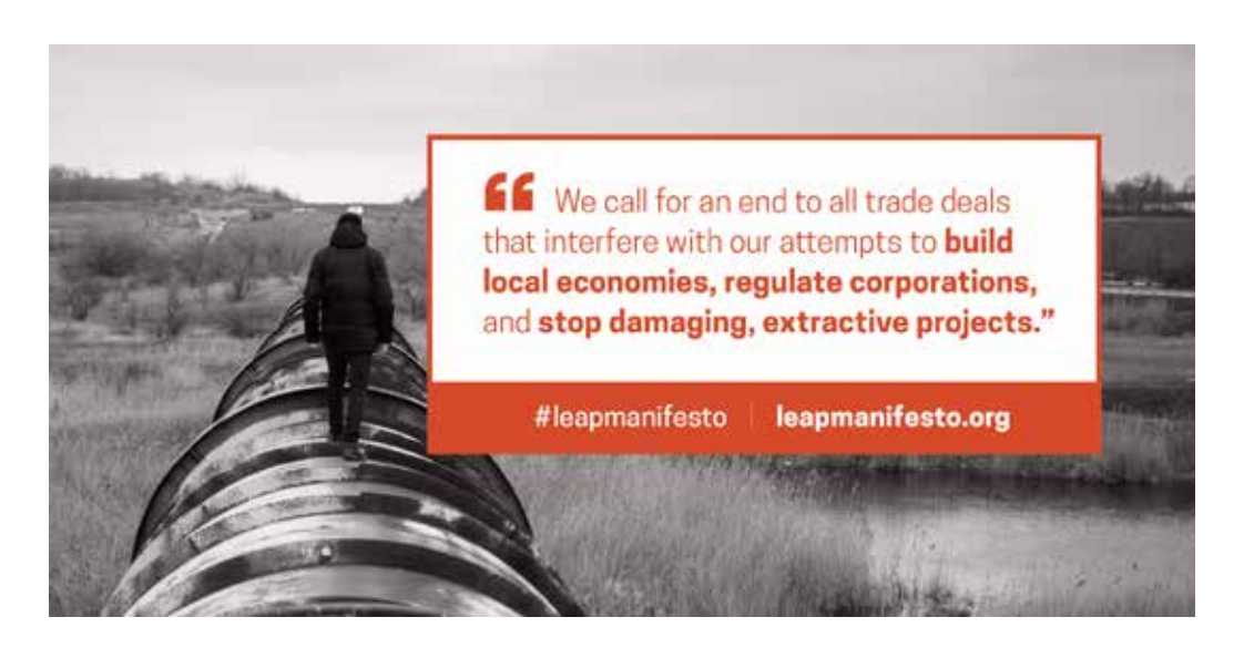
© The Leap Manifesto (reproduced with permission)

Leap Manifesto, arguing instead that the vague document fails to tackle the crucial issue of inequality and instead focuses on resource extraction. Laxer poses a number of questions: How do we build the new green economy? How do we create the new green industries that will be at the heart of the economy? How do we ensure that large corporations no longer set the economic agenda and that the rich pay their share of taxes? Unfairly, in my view, he argues that these questions "are given very short shift in Leap" and derides what he sees