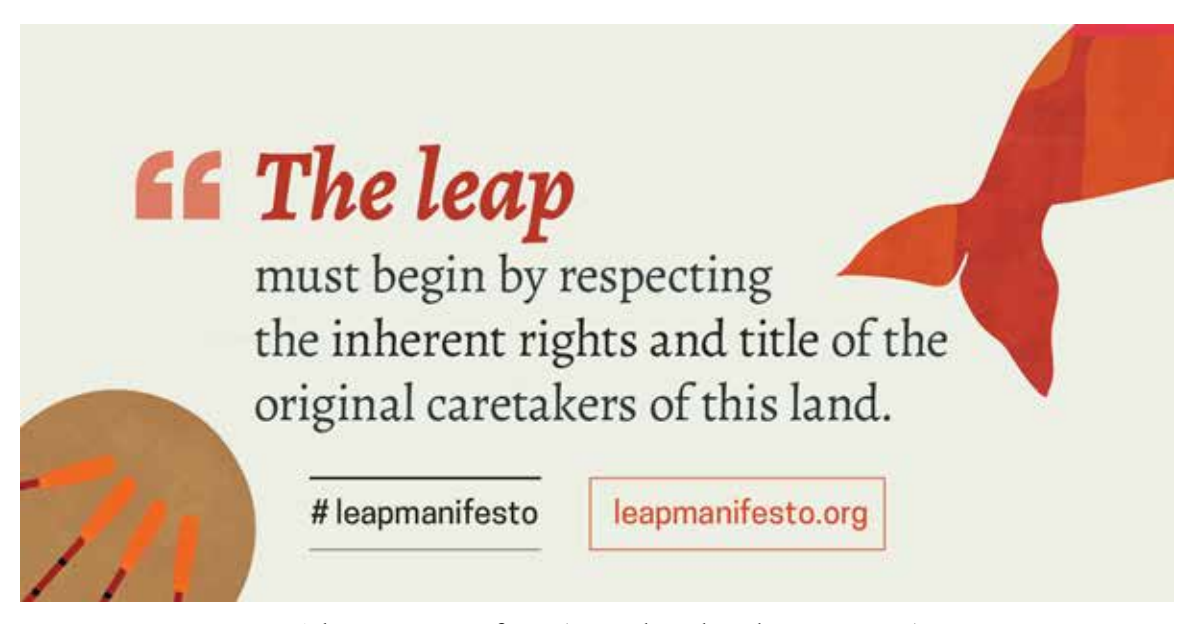
© The Leap Manifesto (reproduced with permission)

crisis - "a crime against humanity's future" - can serve as the spark igniting such a transformation, as there is no other way to deal with the crisis than by redefining basic socio-economic and state structures. In turn, the Manifesto's repeated defence of the inherent rights and title of the Indigenous peoples of Canada shines an unavoidably harsh light on both the resource-extracting capitalist project that Canada is, and the need to 'indigenize' and decolonize Canadian left-wing 'alternatives' traditionally rooted in extractive industrialism.