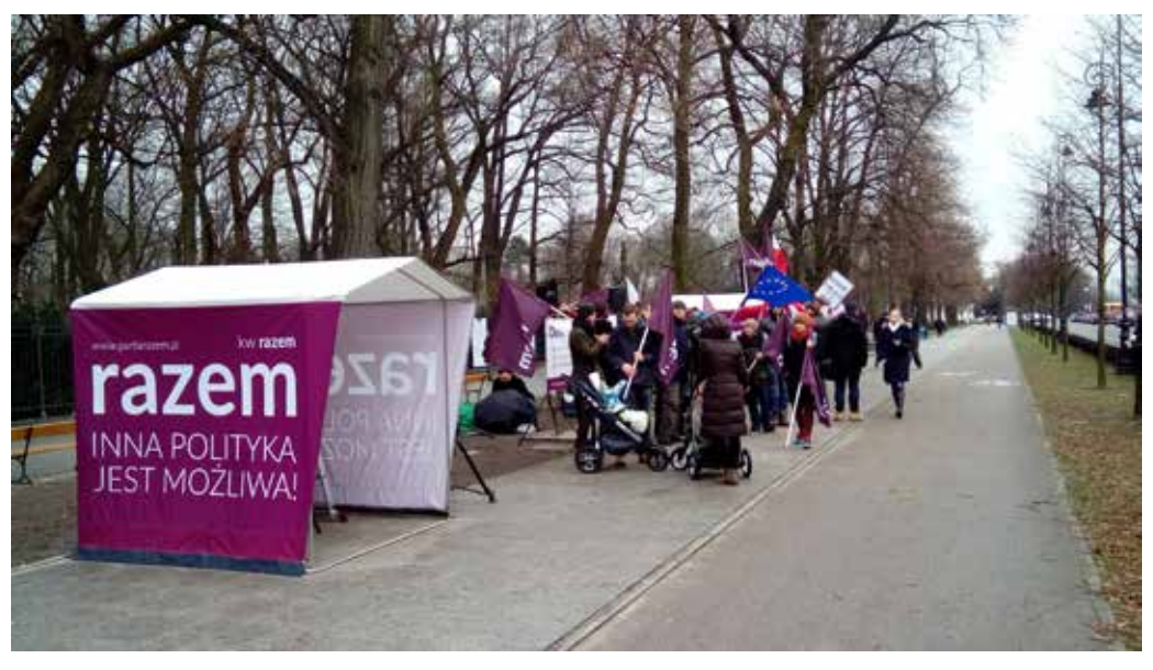
A demonstration by the party Together (Razem) with the visible party slogan "Another Politics is Possible" (Inna polityka jest możliwa) in front of the Chancellery of the Prime Minister

However, this progress towards recovery was somehow derailed by the general political situation in Poland. Having seized power, the PiS launched a series of radical changes in political institutions, clearly devised to establish an authoritarian (or at least illiberal) right-wing regime. Moreover, the PiS also methodically started to